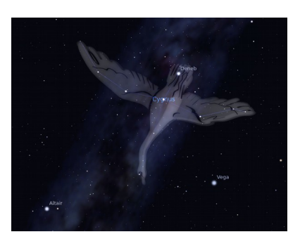
The Summer Triangle (an Asterism)